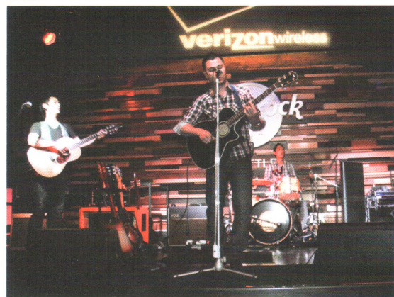
Local band Kings perform on stage